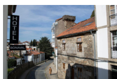
Hotel Ada Bonaval - Santiago de Compostela Hotel Ada Bonaval - Santiago de Compostela