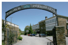
Pousada de Portomarin - Portomarin https://www.pousadadeportomarin.es/