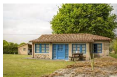
A Parada das Bestas - Palas de Reis https://aparadadasbestas.com/