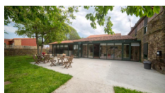
Casa Do Acivro - O Pino https://oacivro.com/