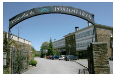
Pousada de Portomarin - Portomarin https://www.pousadadeportomarin.es/