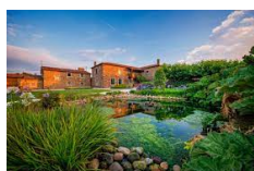
Pazo de Santa Maria - Arzua https://www.pazosantamaria.com/