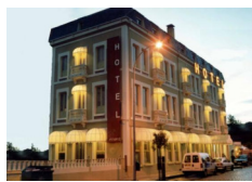
Hotel Restaurante Roma - Sarria https://hotelroma1930.es/

6 nights in double rooms in hotels **/*** ,B&B and agriturismo with breakfast