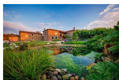
Pazo de Santa Maria - Arzua https://www.pazosantamaria.com/