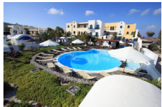
Kalimera Hotel - Santorini www.kalimerasantorini.com