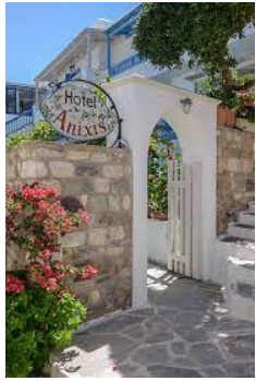
Hotel Anixis - Naxos www.hotelanixis.gr

7 nights in bed and breakfast basis (3 nights in Naxos, 4 nights in Santorini)