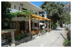
B&B Pachnes Pension - Agia Roumeli www.pachnes.gr