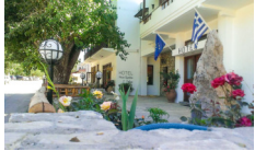
Hotel Neos Omalos - Omalos www.neos-omalos.gr