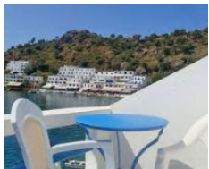
Hotel Kyma - Loutro http://kyma.com.es/