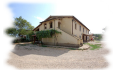
BioBagnolese Agriturismo - Castel Bagnolo www.biobagnolese.it