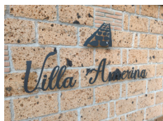
Agriturismo Villa Amerina - Corchiano