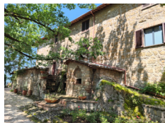
La Locanda della Chiocciola - Orte www.lachiocciola.net

Nights in double room in **/ *** hotels , B&B and agriturismi with breakfast